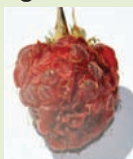
Fruit damage from spotted wing drosophila infestation