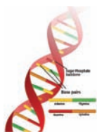
DNA Double Helix